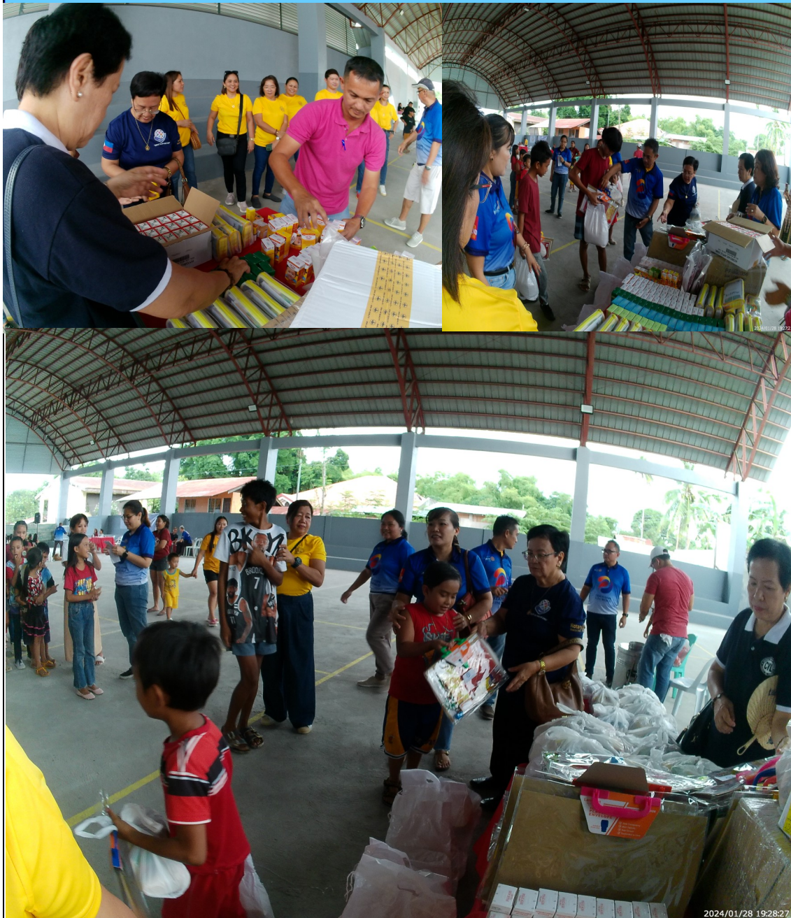
Distribution of school supplies, bags of rice, groceries, medicines, and some sweet treats at Friendly Homes